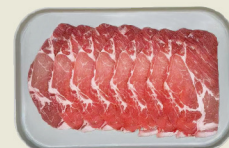
Pork Shoulder 100g Juicy and balanced