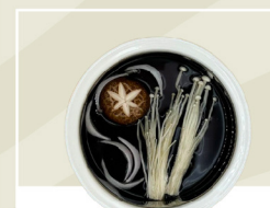
Sukiyaki Broth Sweet / Savory