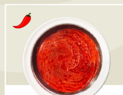
Spicy Broth Mild / Medium / Extra Spicy +3.99