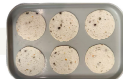
Vegan Shrimp Sausage