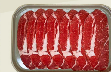
Chuck Eye 100g Juicy and robust