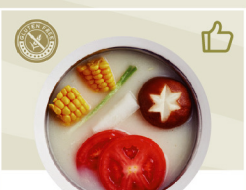
Pork Broth Traditional crafted / Rich / Creamy