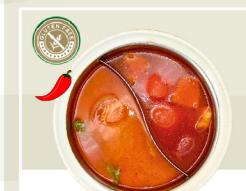
Tom Yum Broth & Tomato Broth