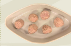
Beef Meatballs 100g