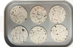
Vegan Mushroom Cake