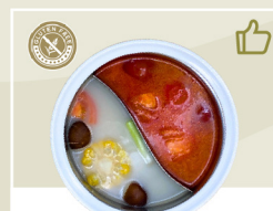
Pork Broth & Tomato Broth