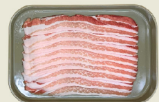
Pork Belly 100g Rich and fatty