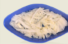
Beef Tripe 100g