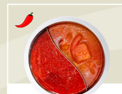
Spicy Broth & Tomato Broth