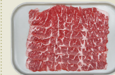
Chuck Tail Flap 100g The classic favorite