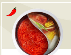
Spicy Broth & Pork Broth