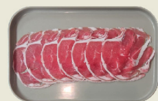
Lamb Flap 100g Delicate and tender