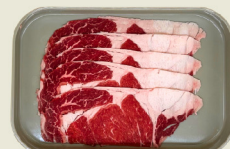
Rib Eye 100g Tender and flavorful