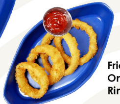
Fried Onion Rings