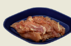
Skinless Premium Chicken Thigh 100g Juicy and flavorful