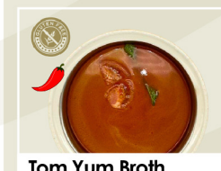
Tom Yum Broth Thai Favorite / Sour-Spicy / Gently Sweet / Coconut Accent