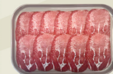
10 Sec. Center Cut Beef Tongue 100g New