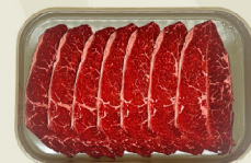
Flat Iron Beef 100g Lean and healthy