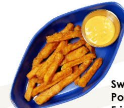
Sweet Potato Fries