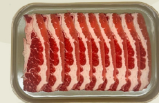
Beef Short Plate 100g Full-bodied and flavorful