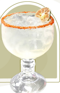
Jumbo Margarita 18.99

Last Call is 20 minutes before the seating time limit ends