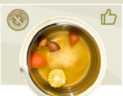
Mushroom Vegan Broth Tomato Vegan Broth