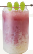
Crush Grape Gummy 11.99 * Mocktail Version 7.99