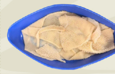
Black Beef Tripe 100g