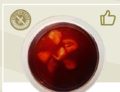
Tomato Broth In-house Classic / Slightly Sour / Gently Sweet