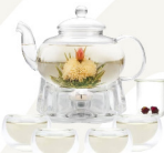
Hot Tea (Pot) 8.99