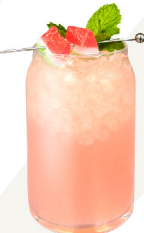
Pink Splash 13.99